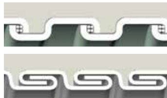
Square-Locked Design with cord packing 3/8" - 1"

See: www.ul.org www.nfpa.org www.naed.org www.nema.org www.anacondasealtite.com